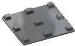
9 Point Pallet