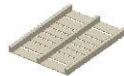
Single Face Pallet